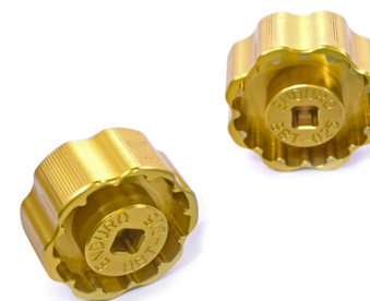
BBT-015 and BBT-025 Pro Cup Tools