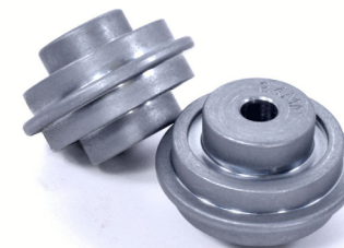
BBT-006 BB90 Tool