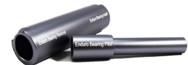
NBT-030 Needle Bearing Tool