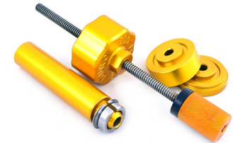
BRT-003 BB86/92 Tool

We offer a wide variety of tools to cover most bearing applications you may encounter.