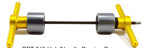
BRT-045 Hub/Needle Bearing Press