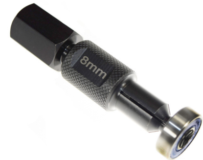
TK puller 8-10mm Blind Puller