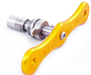
CT-008 Hollowgram Tool