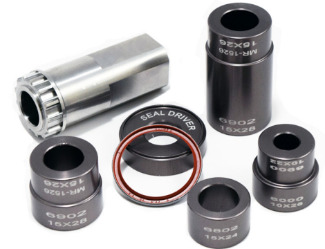
BBT-013 DT Hub Toolset