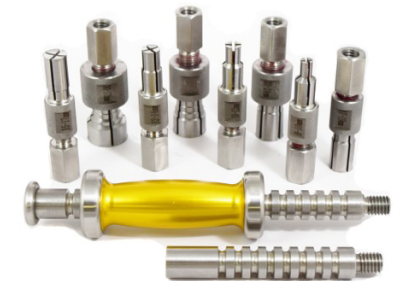
BBT-200 Blind Hole Puller Set