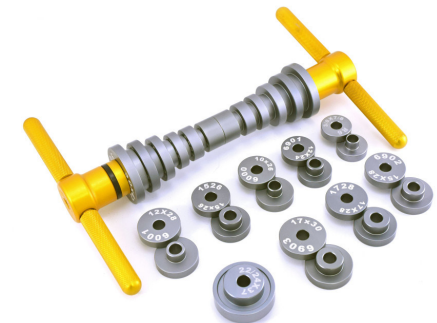
BRT-005 Hub Press